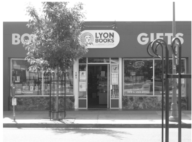
Chico has a new independent bookstore, since November.

Safeway on Mangrove was recently renovated and has new and expanded food departments and now open 24 hours a day. Speaking of Mangrove, the intersections of Mangrove and E. First Avenue plus Cohasset and East Avenue have been expanded and repaved. Martin Luther King, Jr. was honored in Chico in February 2007. Whitman Avenue (between 20 th Street and E. Park Avenue) was re-named Martin Luther King, Jr. Blvd. and a statue was erected in Community Park (off 20 th Street). An interchange at the intersection of Highways 70 and 149 is being constructed.