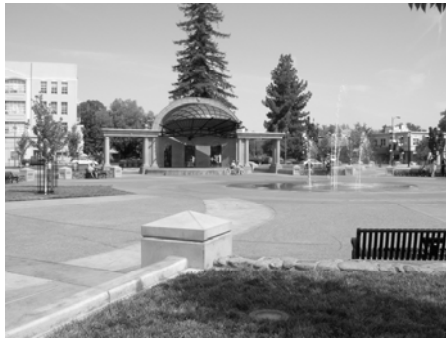
New downtown plaza in Chico.

December, behind the Chico Mall on Springfield Drive, behind Logan's Roadhouse. Chili's opened in March. It's located in the parking lot in the Chico Mall near Marie Calendar's. Not one but two new Starbuck's buildings opened. On the north side of Cohasset Road (off The Esplande) is a new locally owned Golden Valley Bank, part of the Garden Villa center, which opened last year. It reminds some people of Kendall Hall. Behind that is another huge red brick professional complex.