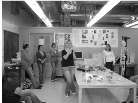
Student interns in Human ID Lab give presentation to visiting classes.