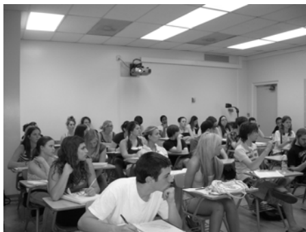
A future generation of anthropologists listen intently to lectures.