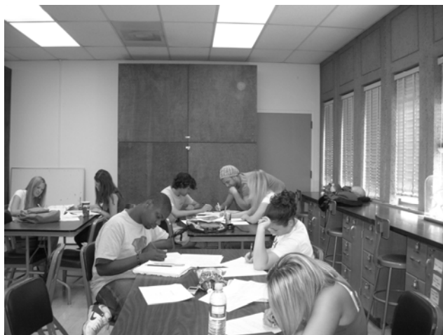
Remember the days? Students studying for finals in the physical lab